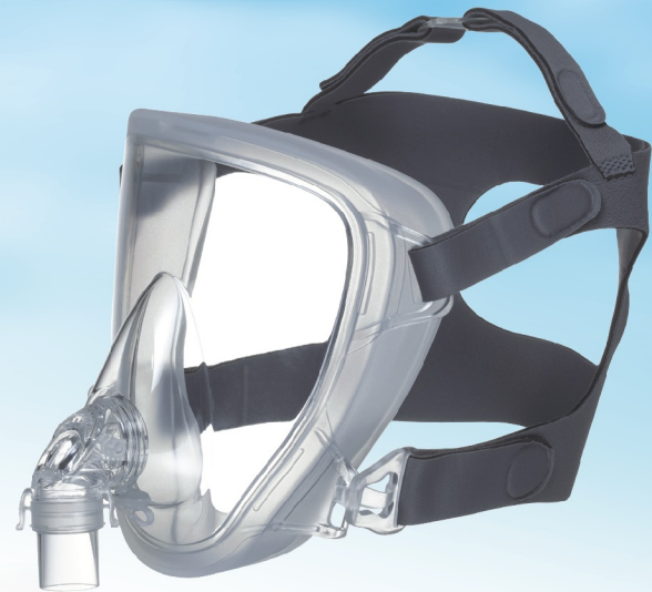
Total Face Mask (For Adult) #13843 Small - S #13844 Medium - M #13845 Large - L