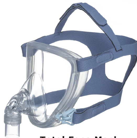
Total Face Mask (For Pediatric) #13831 X Small #13832 Small