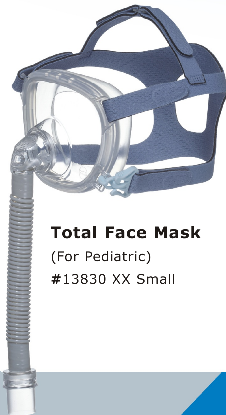
Total Face Mask (For Pediatric) #13830 XX Small