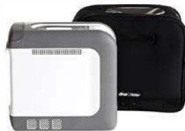
Carrying Case 125D-670