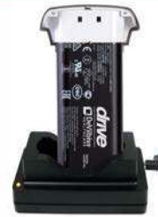
iGo2 Charging Station 125CH-613 (Battery not included)