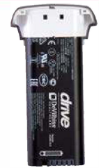
Spare Battery 125D-613