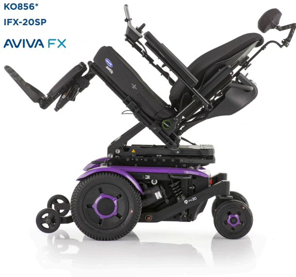
K0856* IFX-20SP AVIVA FX