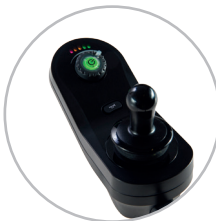
REM110 Drive Only Remote