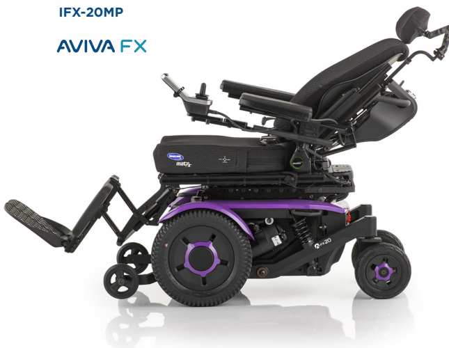
K0861* IFX-20MP AVIVA FX

Also available K0848* with Solid Seat Pan