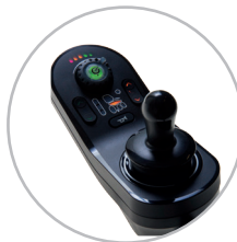
REM210/211 Drive and Power Positioning Remotes