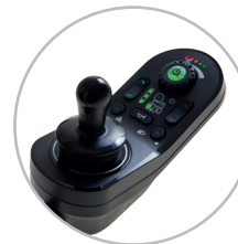
REM215/216 Drive, Power Positioning and Lights Remotes